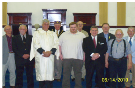
Cast and candidates for the Fourth Degree on June 14th