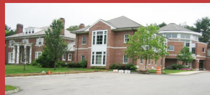
Scottish Rite Headquarters, Lexington, MA