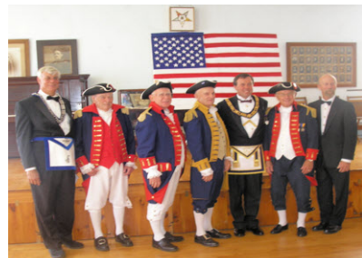
Participants in the Arm Forces Tattoo