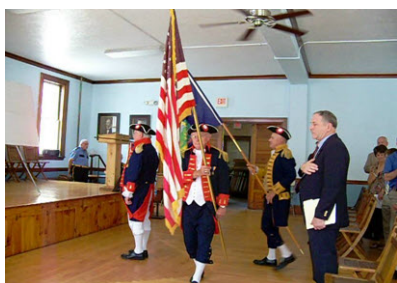
Opening ceremonies of the Arm Forces Tattoo

A collation followed the ceremonies and was host by Bingham Chapter of the Eastern Star.