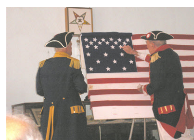
Building of the Flag