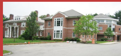
Scottish Rite Headquarters, Lexington, MA

Valley of Brattleboro Scottish Rite Masons