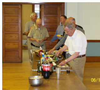
Bros. serving them selves at June 14th meeting