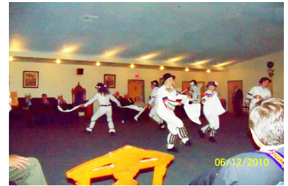
Morris Dancers at the Council of Deliberation