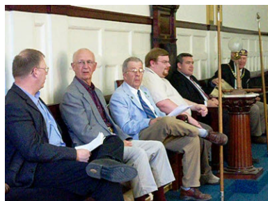
Sideliners for the 4th Degree on June 14th