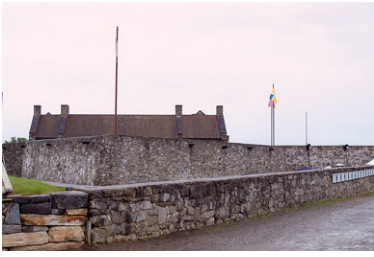
The walk way to the main entrance to the fort.