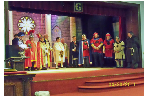
Cast for Consistory