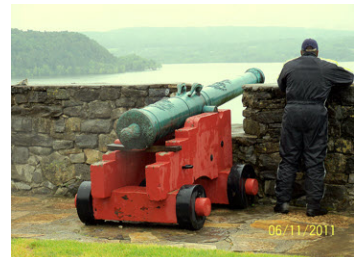
Canon on the outer star of the Fort facing down Lake Champlain