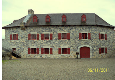
East side barracks at the Fort