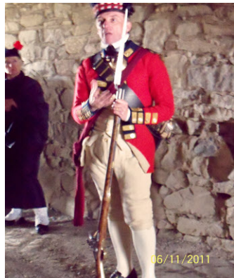
A Black Watch Officer circa 1753