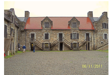
Western barracks at Ft. Ti