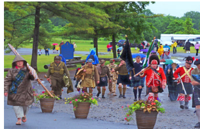
Black Watch re-enactors coming from a memorial ceremony for the Scots who fought at the Battle of Ft. Carillon