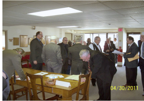
Lobby at Consistory