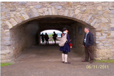
Tunnel Entrance to the Fort