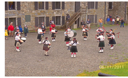
Highland band from New Jersey performing in the days tataroo.