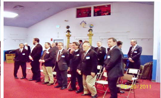
2011 Consistory Class