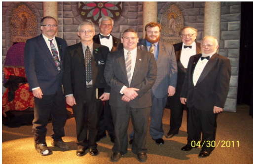
Valley of Brattleboro's new 32 Degree Masons