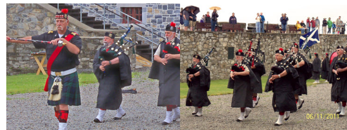
Highland band from New York participating in days Tataroo