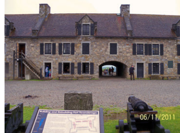
Main gate and officers barracks facing South