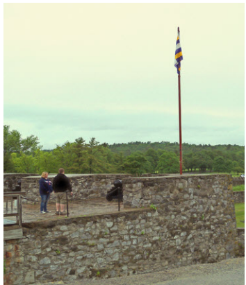
North pointing ramparts of Fort Ti