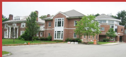
Scottish Rite Headquarters, Lexington, MA